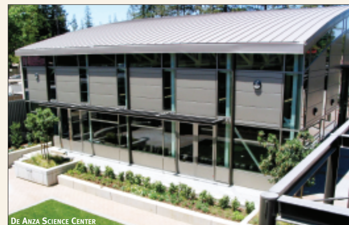
DE ANZA SCIENCE CENTER

The $15 million, multilevel parking structure, scheduled to be completed in December, will provide more than 1,700 much-needed parking spaces to accommodate students and visiting community members.