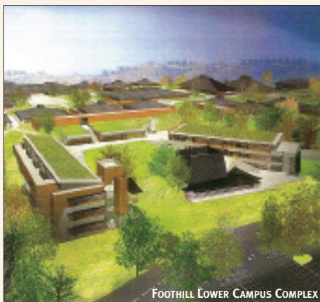
FOOTHILL LOWER CAMPUS COMPLEX