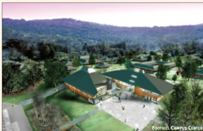
FOOTHILL CAMPUS CENTER

Foothill, called "the most beautiful community college ever built" by the San Francisco Chronicle , won national architectural awards when the campus was built in 1961. In 1980, the campus received a special commendation from the AIA for "excellence in design that has stood the test of time." The new buildings will include material and design elements that give Foothill College its signature architectural style, including brick and exposed aggregate concrete as well as distinctive roof shapes and angled buttresses.